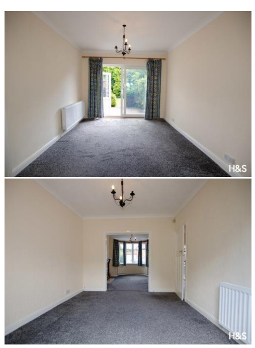
Stonor Road, Hall Green, Birmingham,