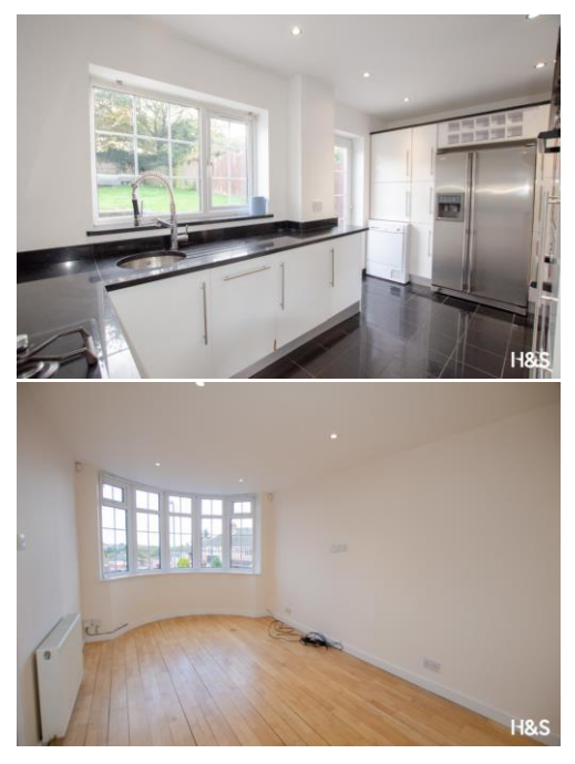
Kendal Avenue, Coleshill, Birmingham,