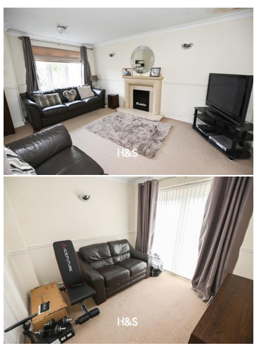
Chadstone Close, Monkspath, Solihull,